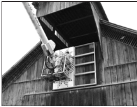
Quilt hanger hired by the Appalachian Resource, Conservation, and Development Council—better known as Appalachian RC&D Council.

The pattern reflects a Biblical subject which was familiar and important to the maker. The designer of the quilt had an eye for simplicity since only two fabrics were used in the quilt and the border. The quilt is pieced entirely by hand and is quilted in an “elbow design” where the elbow is placed on